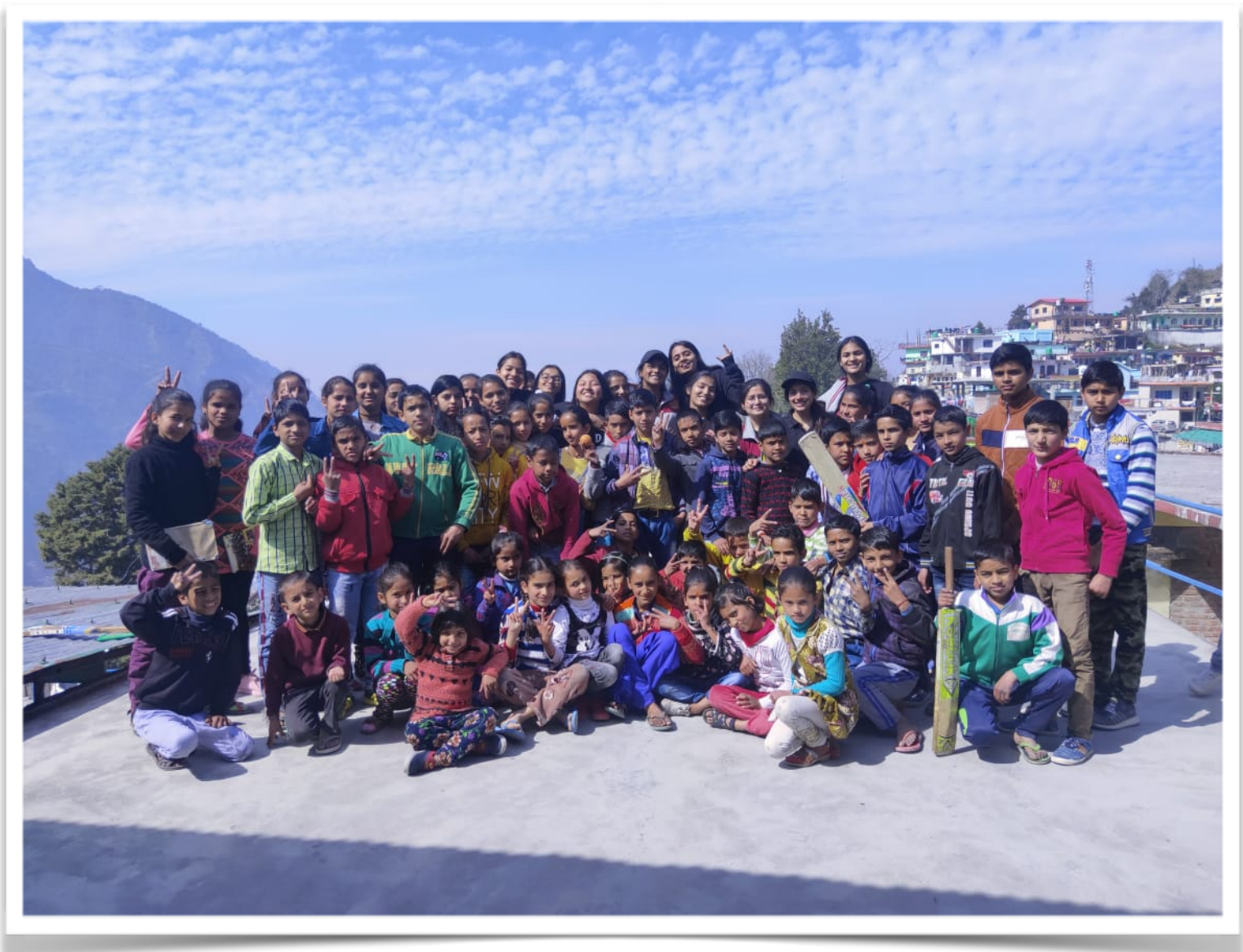
COMMUNITY OUTREACH PROGRAMME: OUR MISTars MAKING A DIFFERENCE